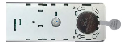
Figure 2: Remote with battery cover removed